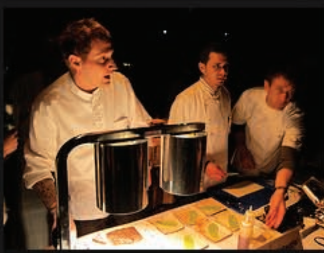
Michael Voltaggio and Sous Chefs

Michael Voltaggio was also out to represent The Langham, plating wagyu with cheddar having the consistency of pasta atop the creme of the very dehydrated broccoli which served as the garnish. Voltaggio's imaginative style is complimented by a deferential demeanor. It took much restraint on behalf of my companions' and me to stop gawking at the lady whom we overheard ask Top Chef for a "slice of [wagyu] meat that's well done." (Voltaggio merely repeated, "Well done?" with