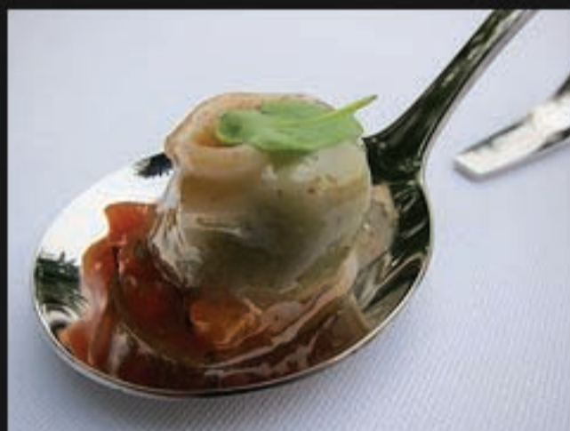
Apricot Tortellini from FIG