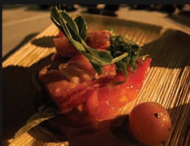
Bacon-Wrapped Bacon from FIG