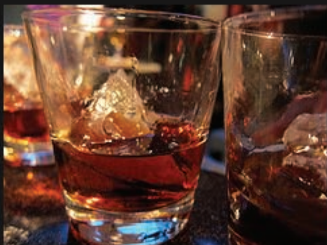
The Highlander (With Highland Park 12)