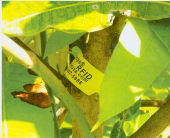
TRACEABILITY: Could RFID tags help solve or even prevent many food safety issues? Find out at RFID World in Las Vegas.

We're predicting standing-room-only attendance for the day-long "Food Traceability: Securing the Food