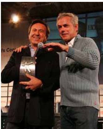
Daniel Boulud and David Bouley still a wannabe chef.

So far Eleven Madison Park, Per Se, Le Cirque, and 5 others have city permission to use the technique. Recently, famed chef Joel Robuchon, who has been using sous vide for over 20 years, spoke about the technique at the Star Chefs International Chef Congress here in New York City and demonstrated how he is able to cater an event for 5000 guests and deliver a perfectly cooked piece of duck. When one can take a piece of foie gras, place it atop a piece of duck breast, wrap it in a cabbage leaf and cook both proteins, which have different cooking times, to perfection using this technique – you know they have to be on to something.